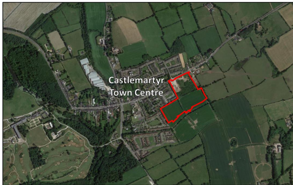
Figure 1 – Location of site in context of Castlemartyr Town Centre

This report provides details on the current capacity of existing and proposed childcare facilities in the area together with the demand for places likely to be generated by the proposed development.