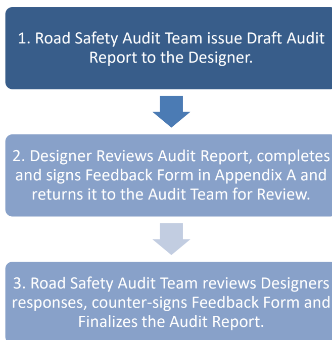
Figure 4.1 – Road Safety Audit Sign-Off and Completion Process

When completed, this form should be signed by the Designer and returned to the Audit Team for consideration. See flow-chart following for further description.