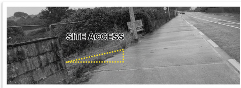
Figure 2.1 – Steep Approach to N25 Could Lead to Vehicle Stalls

The unusually steep uphill gradient could lead to vehicles either rolling back or stalling as they attempt to join the N25. This is likely to increase the risk of a collision at the site access.