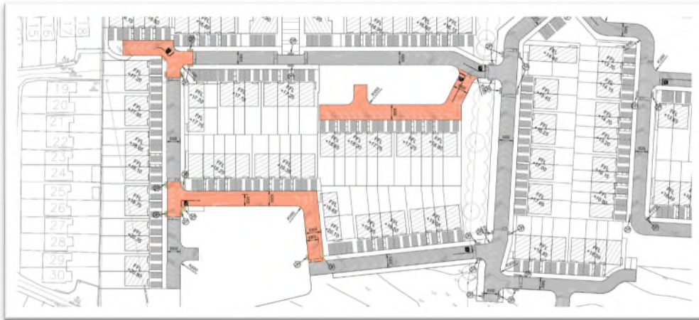
Figure 2.3 – Streets Where Vehicles Will Share Space with Vulnerable Road Users

It may not be readily apparent to drivers entering Homezone streets that they will be required to give way to pedestrians (including children at play), who will be sharing the road space with them. This is likely to increase the risk of conflict between vehicles and vulnerable road users in Homezone streets.