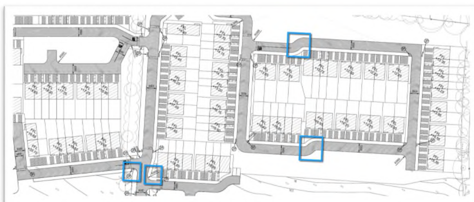
Figure 2.2 – Locations Where Abrupt Turns Could Lead to Driver Conflicts

The abrupt (low radius and sharp) changes in direction could lead to opposition type vehicle conflicts or drivers mounting kerbs.