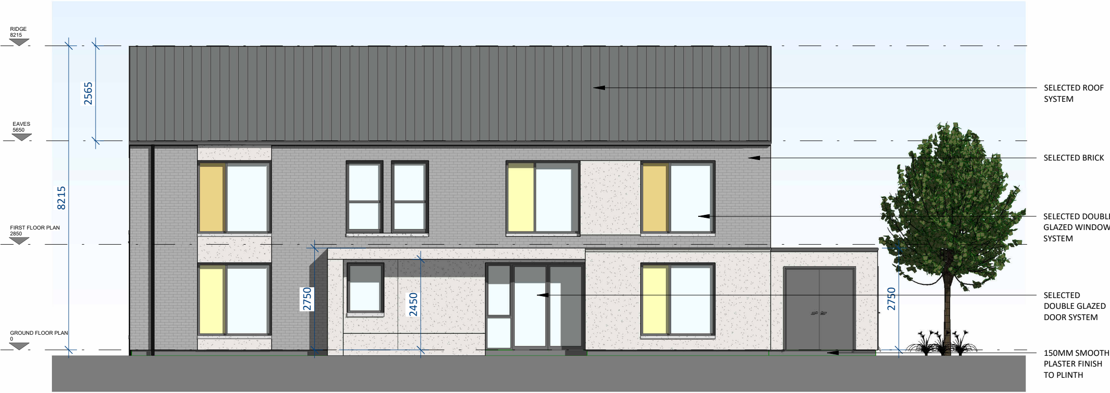
FRONT ELEVATION SCALE 1 : 100