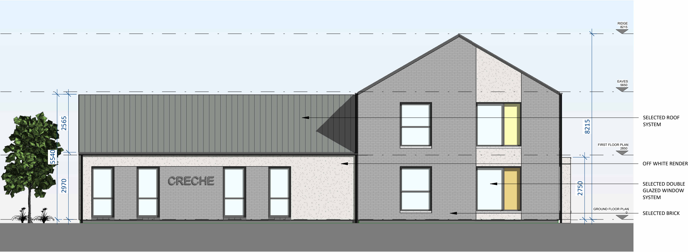
SIDE ELEVATION SCALE 1 : 100

DO NOT SCALE. WORK TO FIGURED DIMENSIONS ONLY. ALL EXISTING DIMENSIONS TO BE CHECKED ON SITE. DRAWN ON AUTOCAD R2004 AT DEADY GAHAN ARCHITECTS LTD LAYERS ON THIS DRAWING COMPLY WITH BS 1192: PART 5