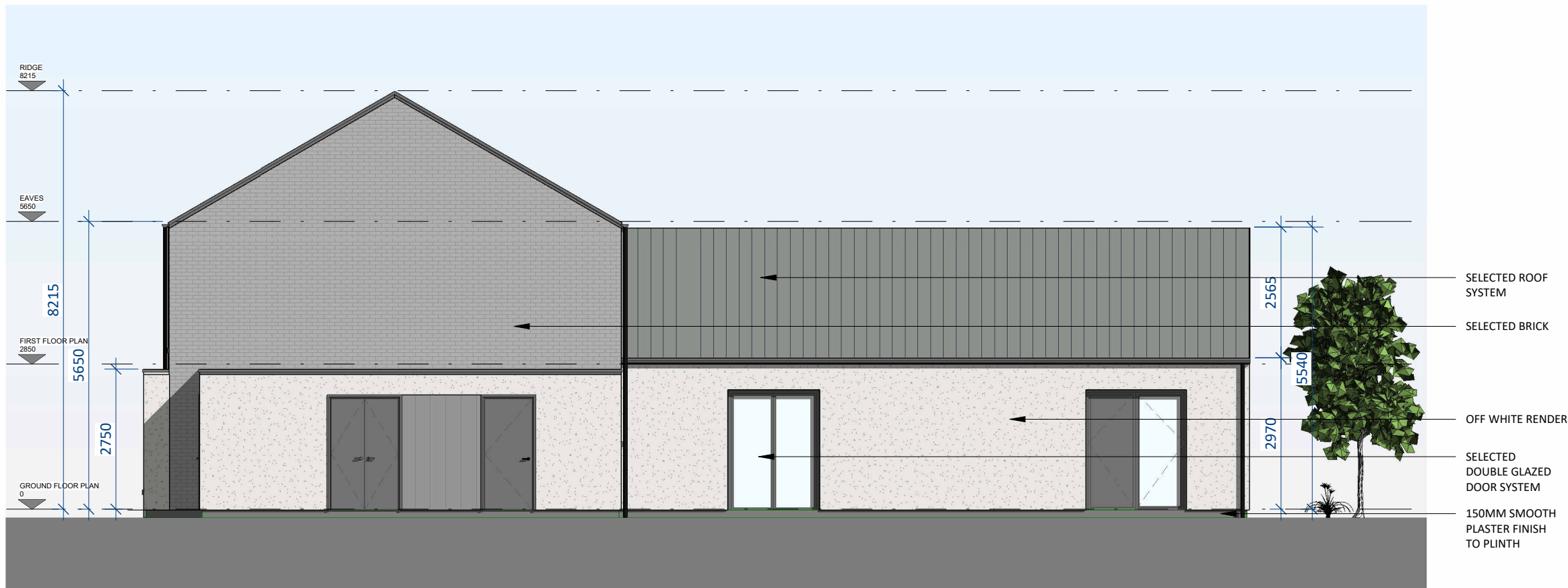
SIDE ELEVATION 02

DO NOT SCALE. WORK TO FIGURED DIMENSIONS ONLY. ALL EXISTING DIMENSIONS TO BE CHECKED ON SITE. DRAWN ON AUTOCAD R2004 AT DEADY GAHAN ARCHITECTS LTD LAYERS ON THIS DRAWING COMPLY WITH BS 1192: PART 5