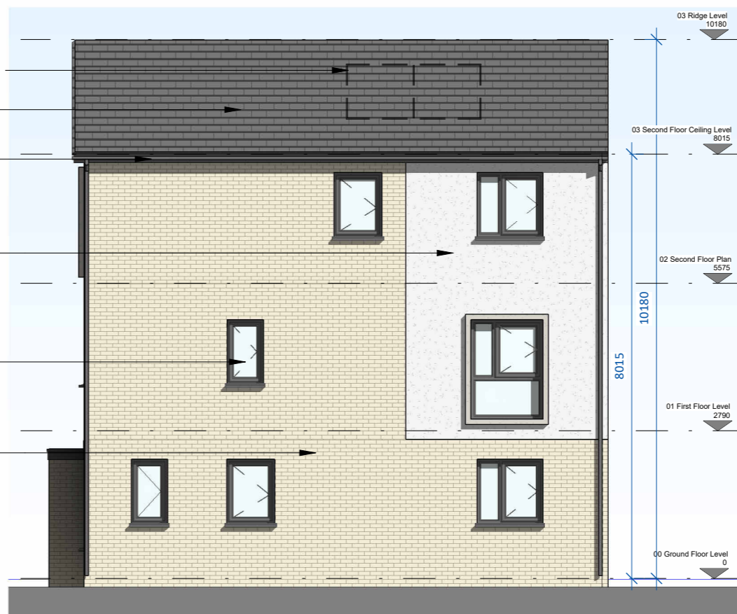
Side Elevation 1