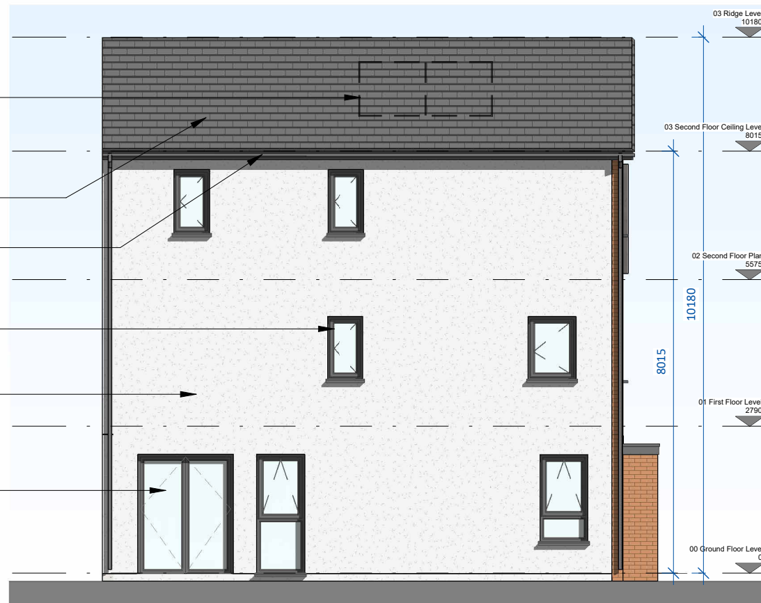
Side Elevation 2