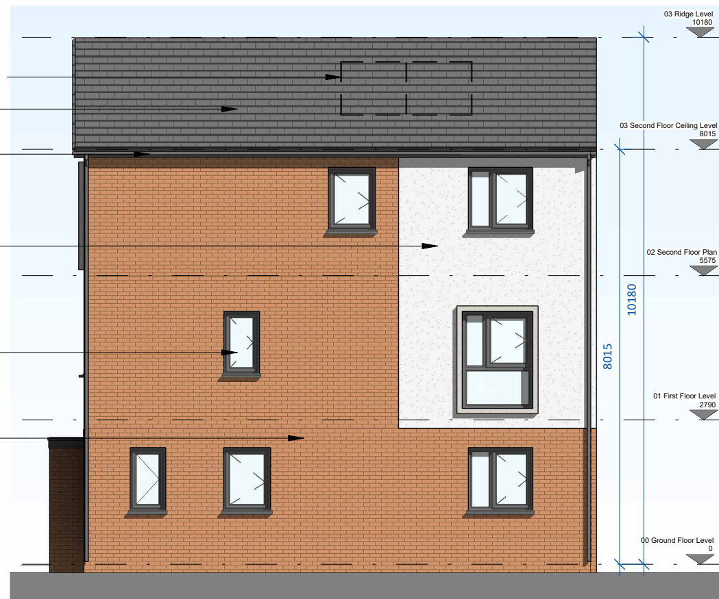
Side Elevation 1